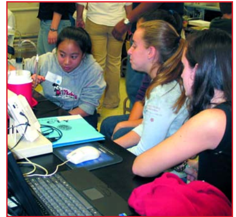
Eighth grade students conduct the lizard respiration experiment